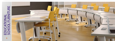
EDUCATIONAL SCHOOL FURNITURE