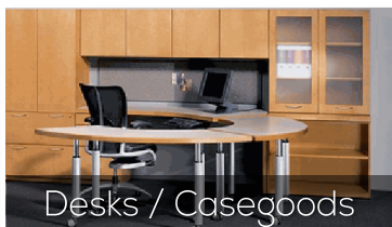
Desks / Casegoods